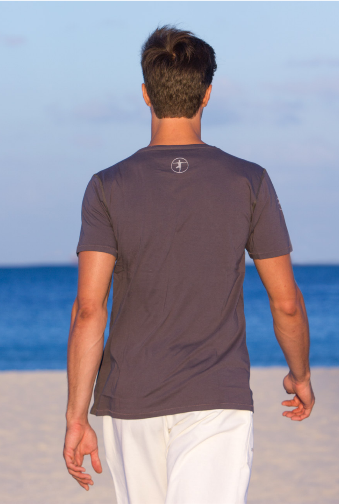
Organic Crew neck tee Full moon night # Y4780 910