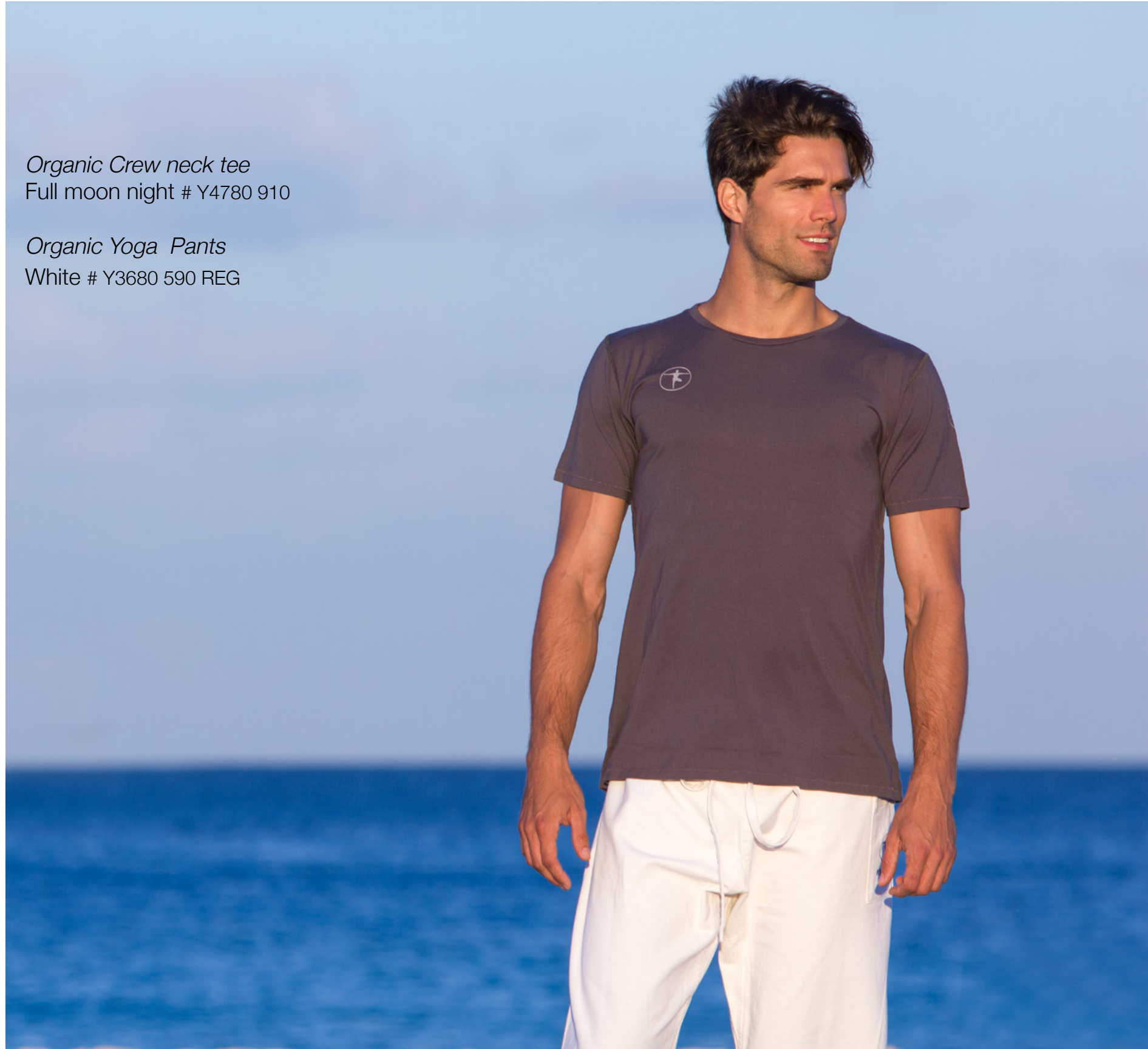
Organic Yoga Pants White # Y3680 590 REG